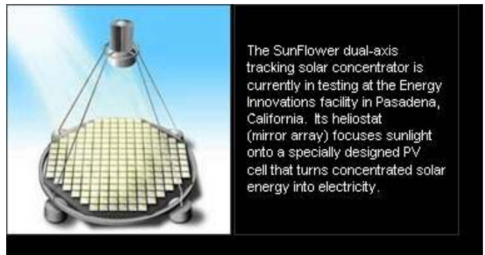
The SunFlower dual-axis tracking solar concentrator is currently in testing at the Energy Innovations facility in Pasadena, California. Its heliostat (mirror array) focuses sunlight onto a specially designed PV cell that turns concentrated solar energy into electricity.

Wind Power, Featured Manufacturer: Southwest Windpower, Alternative Energy Store, website: http://shop.altenergystore.com/